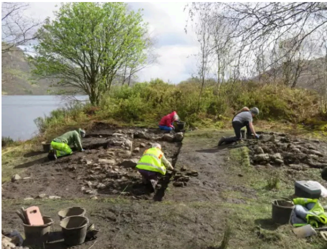
Archaeologists at the site of 17th Century almshouses at the western shore of Loch Lomond.

While this time of year may draw our attention to Highland Festivals / Celtic Games, it is important to recognize the significant impact CMW is making in connecting the present to the past. While many individual members actively chip away at the metaphorical genealogical “walls” they’ve encountered, others are digging in the dirt...literally!