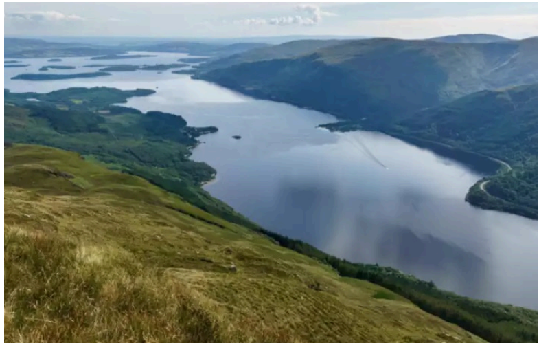
Loch Lomond viewed from Ben Lomond with the lost settlements found west of the water, from the shoreline through Arrochar.