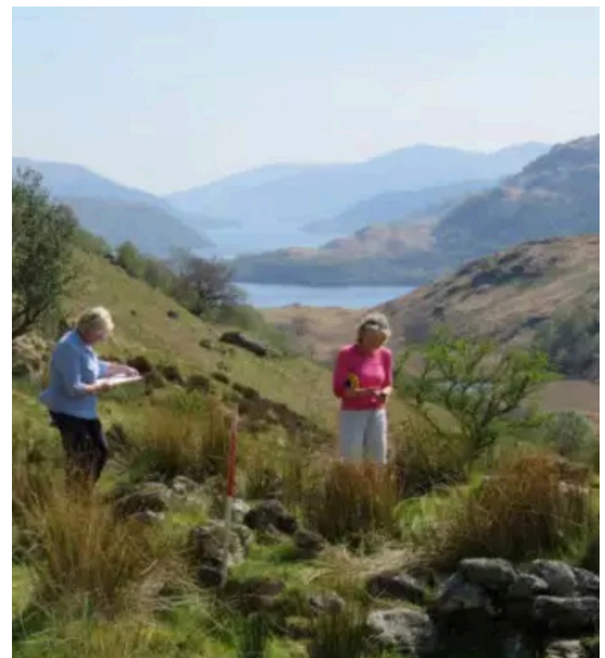
Archaeologists at a deserted settlement overlooking Loch Lomond.